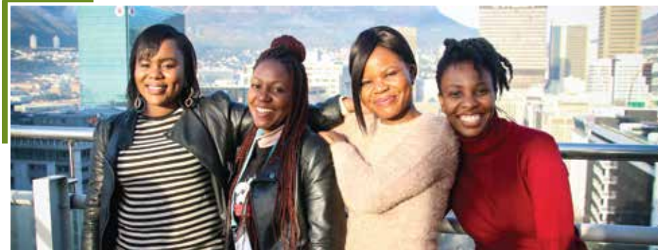
The Canon Collins Trust has supported over 3,500 scholars through their studies since 1981.