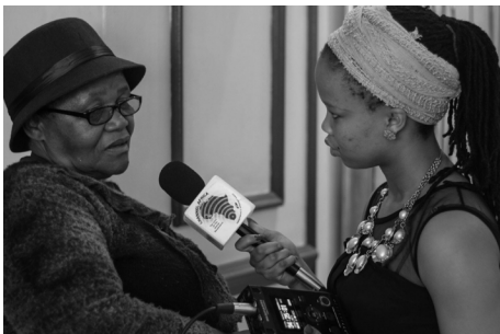
The widow of one of the claimants in the Legal Resource Centre's silicosis lawsuit is interviewed on South African radio.

As a small charity, the Trust's costs are relatively low and very little will be spent on overheads.