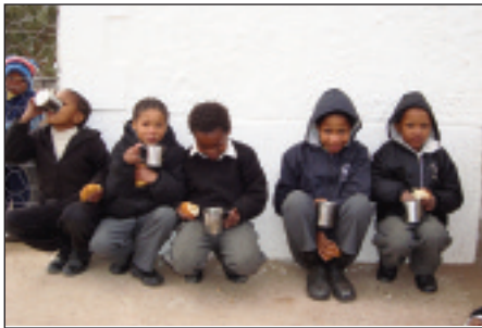
Above: Children at Umthombo Wolwazi School in Northern Cape. Above right: Girls at the AGLIT Project in Malawi.