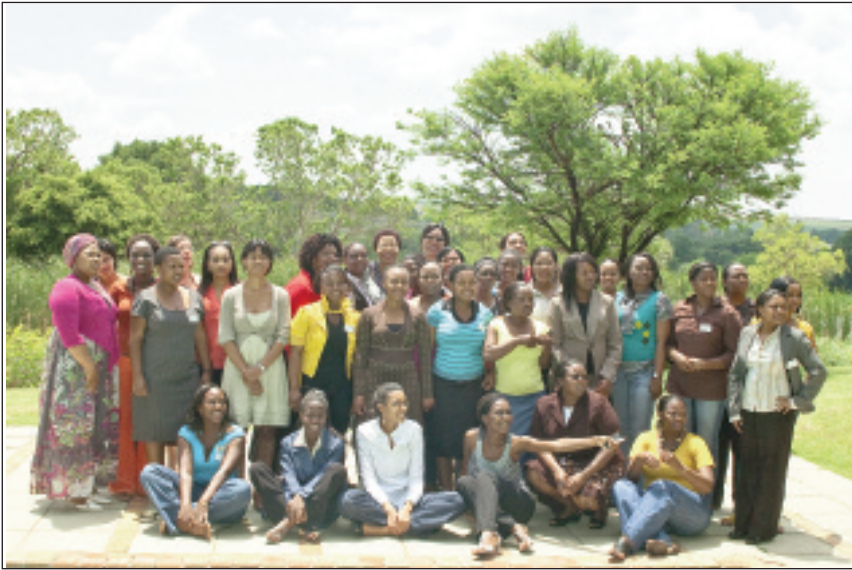
From left: Graça Machel (centre of back row) with her scholars in Johannesburg.

More than 40 inspiring women came together in Johannesburg in November to develop their vision of a peaceful and prosperous southern Africa.