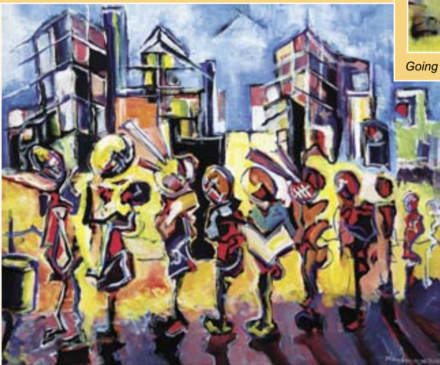
Waiting for a Miracle , by Victor Mavedzenge.