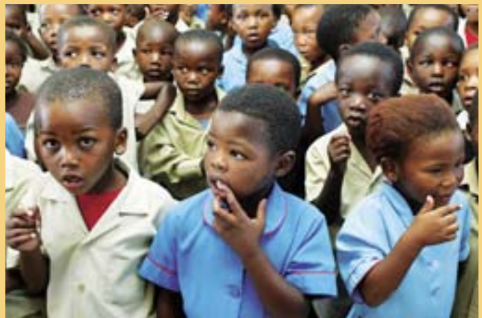
Children learn how to brush their teeth as part of Phelophepa's outreach work.