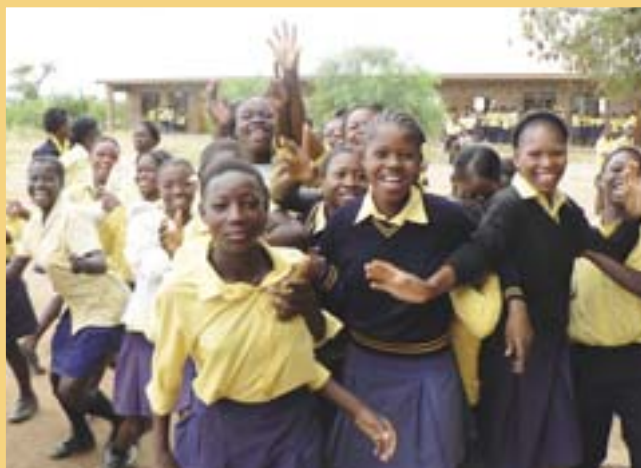
Pupils at Kheodi School, where a new computer lab has been installed.