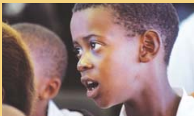
Child singing at Umthombo Wolwazi School, Hantam