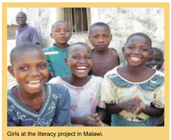
Girls at the literacy project in Malawi.

In 2008 Canon Collins Trust was able to resume its support to the Adolescent Girls' Literacy Project, enabling girls in rural Malawi to access education, health advice and micro-enterprise training. Girls access these services through local youth clubs, through which they gain the skills and confidence to rejoin the school system. The programme is transforming lives, with many formerly illiterate young women now running their own businesses and managing independent bank accounts. Their achievements illustrate the empowering effect of girls' education in increasing living standards and freedom of choice.