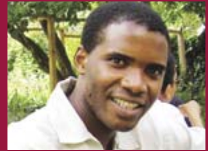
J & J Group Development Trust

Since 1981, Canon Collins Trust has enabled thousands of southern Africans to pursue higher education, and worked with over 30 local organisations to increase educational access for marginalised groups. By focusing on education, the Trust is helping southern Africans to develop home-grown strategies to tackle poverty and promote social justice.