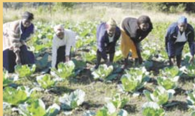
Community members trained by Edu-Clinic volunteers grow cabbages to help to maintain a healthy diet.

Canon Collins Trust continued to support the Phelophepa Health Train as it journeyed across South Africa bringing healthcare and education to the remotest regions of the country. In 2008 the Train stopped at Colesberg, enabling us to initiate a valuable partnership between Phelophepa and the Hantam Community Education Trust. Three Hantam staff received health education training in the Phelophepa 'Edu-Clinic', while children at the three Hantam partner schools received free dental care and spectacles. Several children also took part in group counselling and storytelling offered by Phelophepa's team of psychologists.