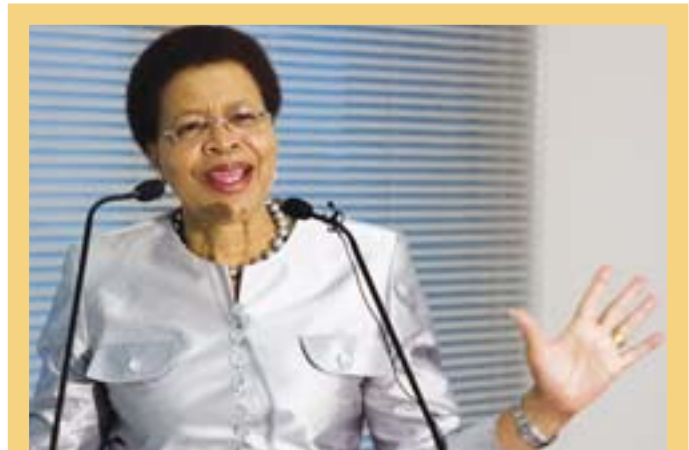
Graça Machel addresses industry leaders at our scholarship fundraising event in Johannesburg.